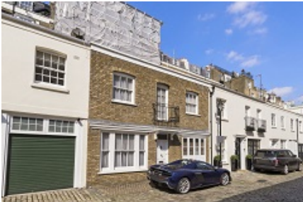
South Eaton Place SW1W