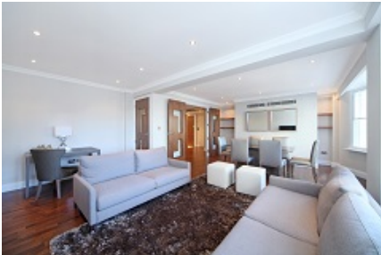
West Eaton Place Sw1X